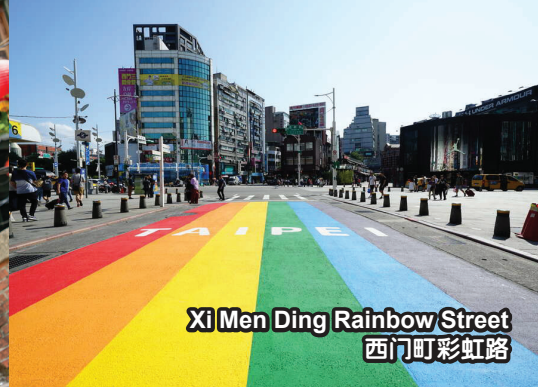
Xi Men Ding Rainbow Street 西门町彩虹路