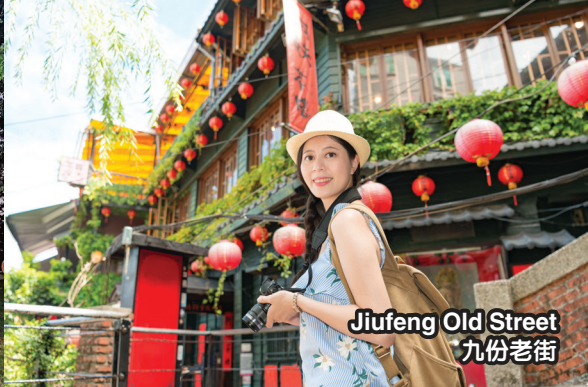
Jiufeng Old Street 九份老街