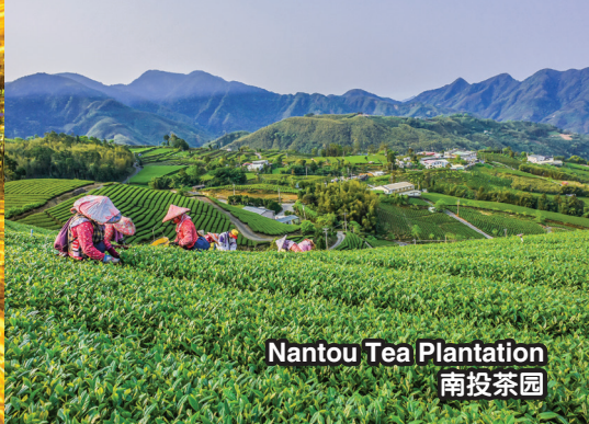
Nantou Tea Plantation 南投茶园