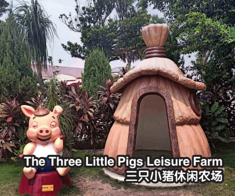
The Three Little Pigs Leisure Farm 三只小猪休闲农场