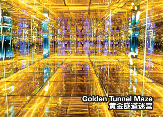
Golden Tunnel Maze 黄金隧道迷宫