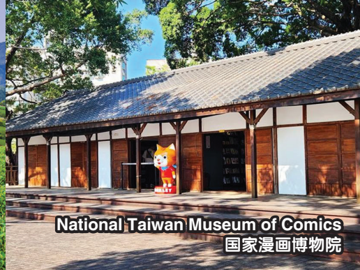
National Taiwan Museum of Comics 国家漫画博物院