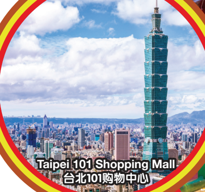
Taipei 101 Shopping Mall 台北101购物中心