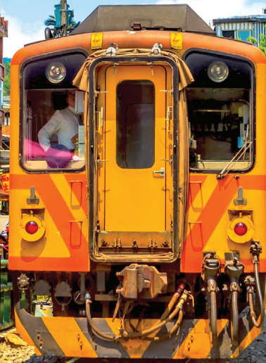
Shifen Old Street 十份老街

行程次序，以當地旅社安排為準。 Sequences of Itinerary are subject to local arrangement.