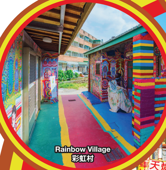
Rainbow Village 彩虹村