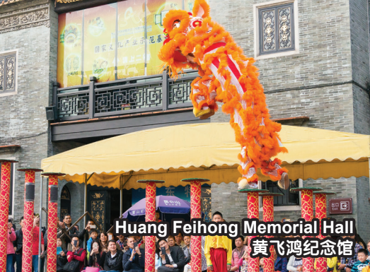
Huang Feihong Memorial Hall 黄飞鸿纪念馆