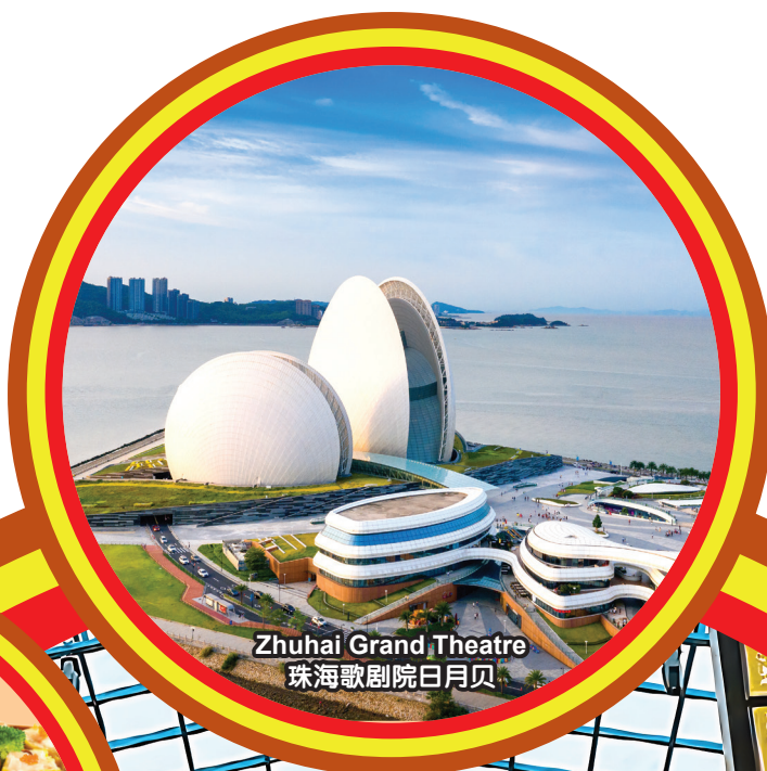
Zhuhai Grand Theatre 珠海歌剧院日月贝