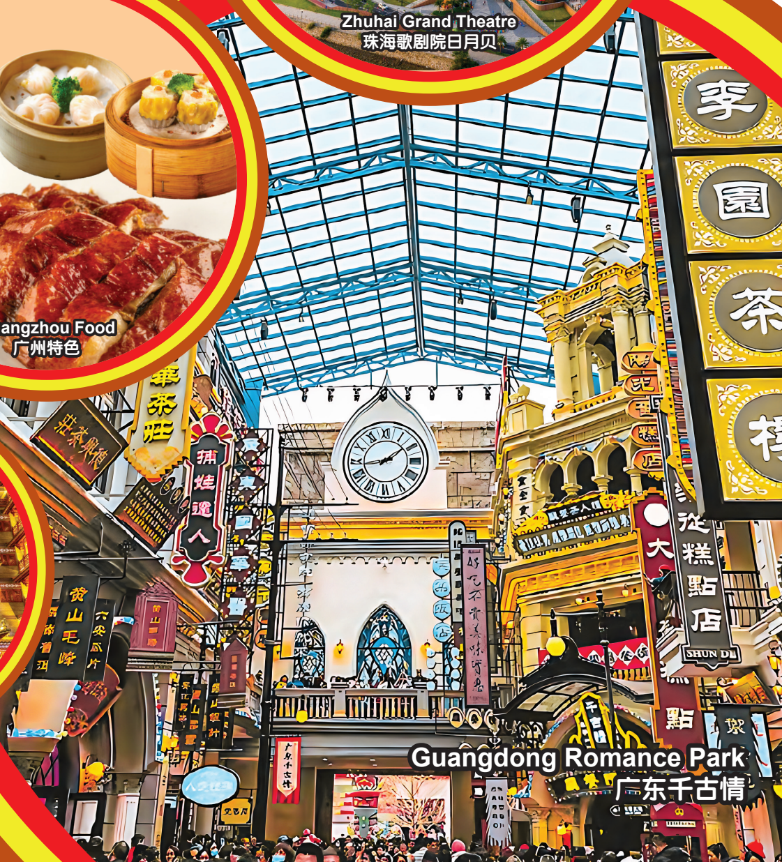
Guangdong Romance Park 广东千古情

行程次序，以当地旅社安排为准。 Sequences of Itinerary are subject to local arrangement.