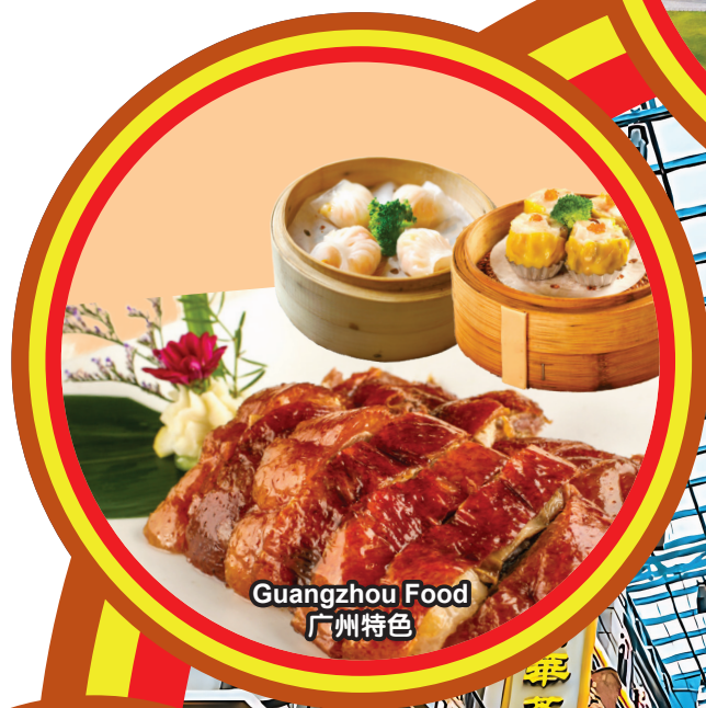
Guangzhou Food 广州特色