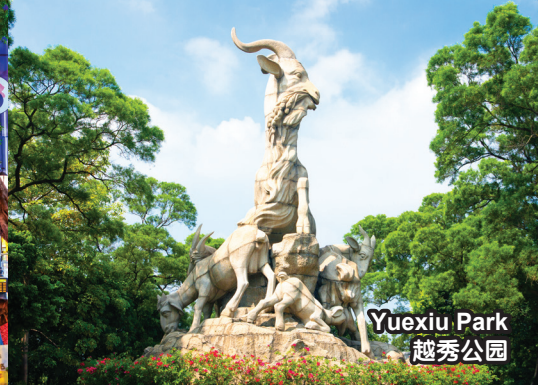
Yuexiu Park 越秀公园