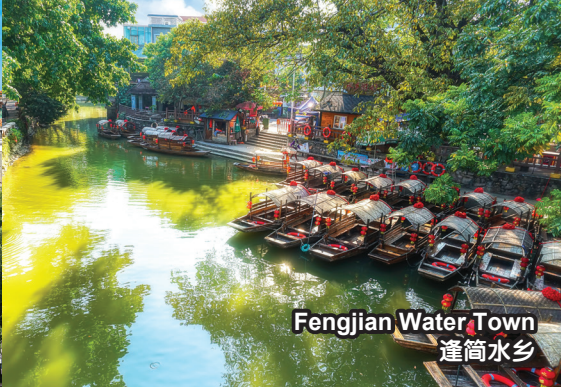
Fengjian Water Town 逢简水乡