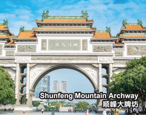
Shunfeng Mountain Archway 顺峰大牌坊