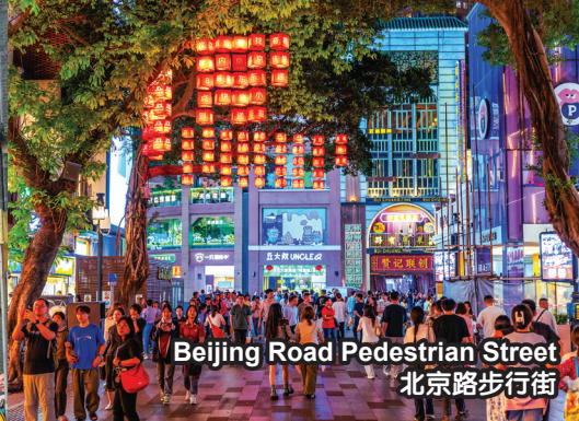
Beijing Road Pedestrian Street 北京路步行街