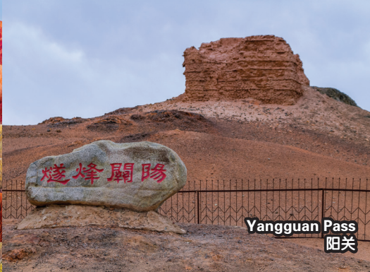
Yangguan Pass 阳关