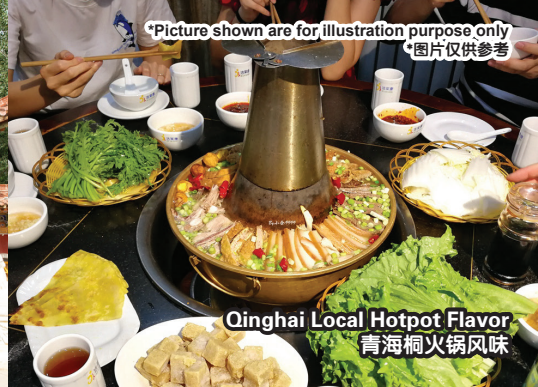
Qinghai Local Hotpot Flavor 青海桐火锅风味