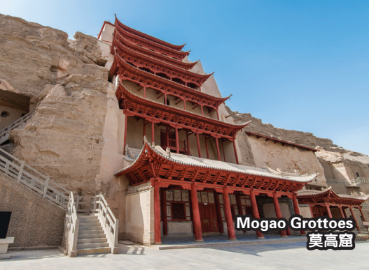
Mogao Grottoes 莫高窟