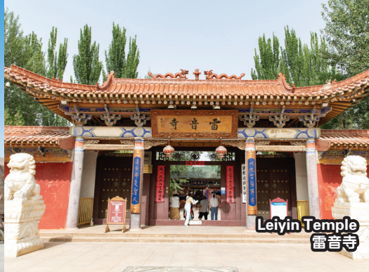
Leiyin Temple 雷音寺