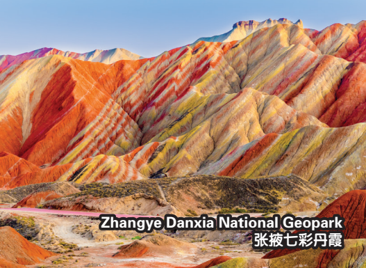
Zhangye Danxia National Geopark 张掖七彩丹霞