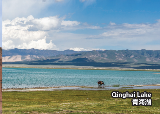
Qinghai Lake 青海湖