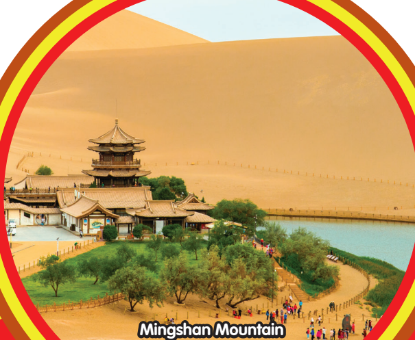
Mingshan Mountain and Crescent Moon Spring 鸣沙山月牙泉