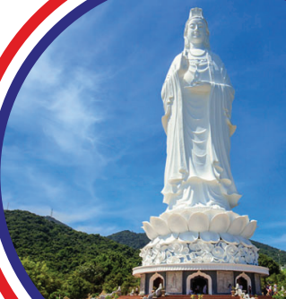
Son Tra Peninsula 山茶半岛

行程次序，以当地旅社安排为准。 Sequences of Itinerary are subject to local arrangement.