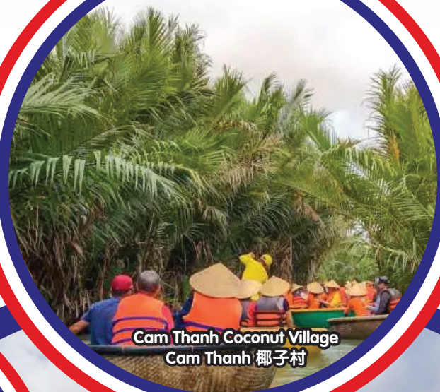
Cam Thanh Coconut Village Cam Thanh 椰子村