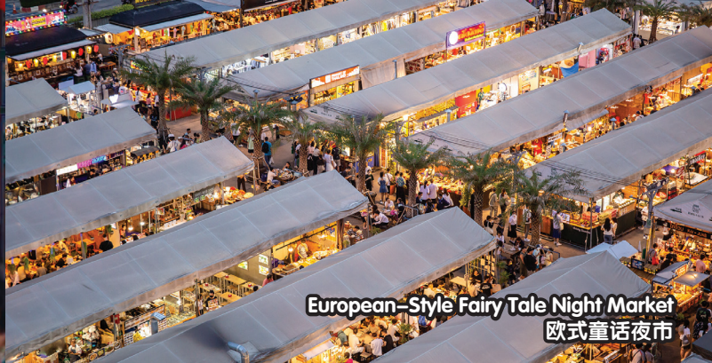
European-Style Fairy Tale Night Market 欧式童话夜市