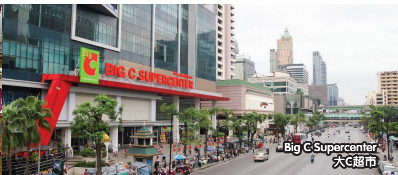
Big C Supercenter 大C超市

免责声明：由于新冠肺炎疫情旅行限制当地/ 宗教节日，公众假期，天气状况，交通等情况，自然灾害，必要时黄金旅程保留对行程进行适当调整（调整景点游览顺序）以确保行程顺利进行，会或事先通知。