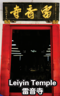
Leiyin Temple 雷音寺