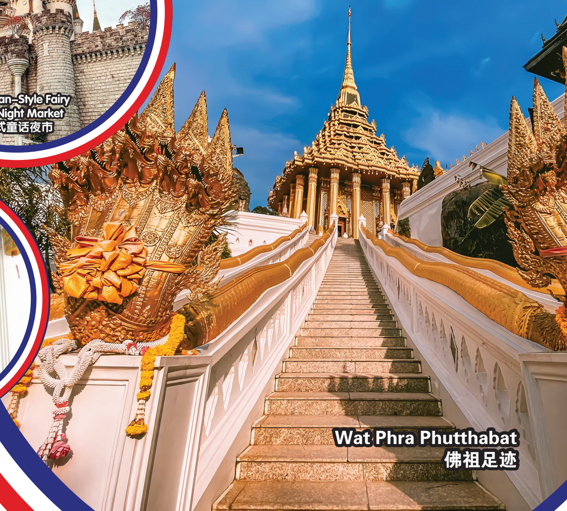
Wat Phra Phutthabat 佛祖足迹

行程次序，以当地旅社安排为准。 Sequences of Itinerary are subject to local arrangement.