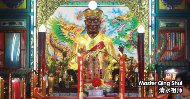
Master Qing Shui 清水祖师