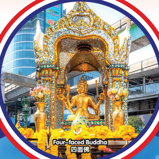
Four-faced Buddha 四面佛