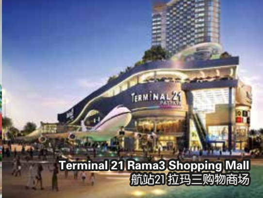
Terminal 21 Rama3 Shopping Mall 航站21拉玛三购物商场