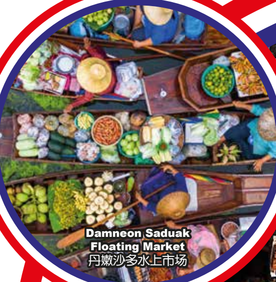
Damneon Saduak Floating Market 丹嫩沙多水上市场