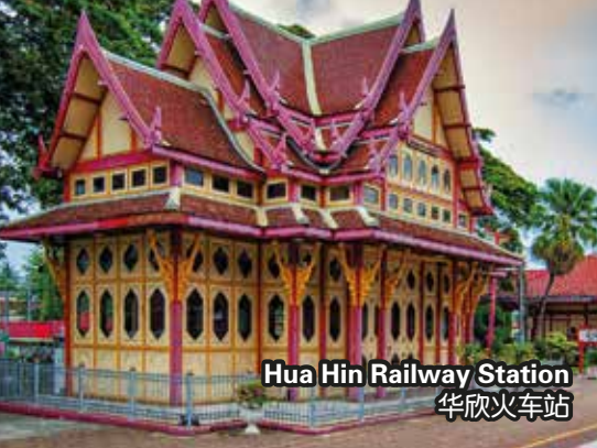
Hua Hin Railway Station 华欣火车站