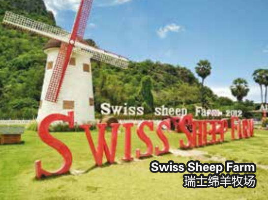
Swiss Sheep Farm 瑞士绵羊牧场