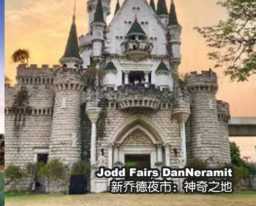
Jodd Fairs DanNeremit 新乔德夜市: 神奇之地