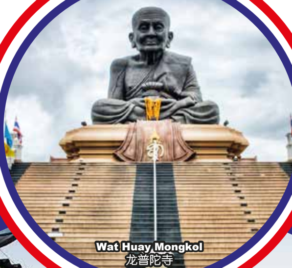
Wat Huay Mongkol 龙普陀寺