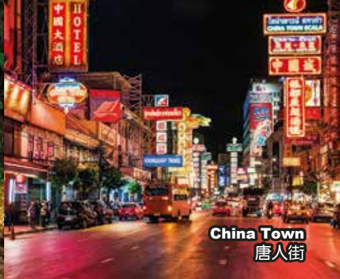
China Town 唐人街