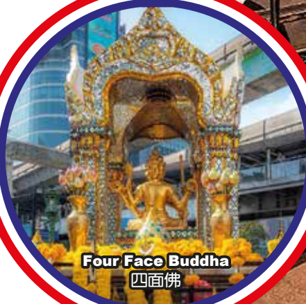
Four Face Buddha 四面佛