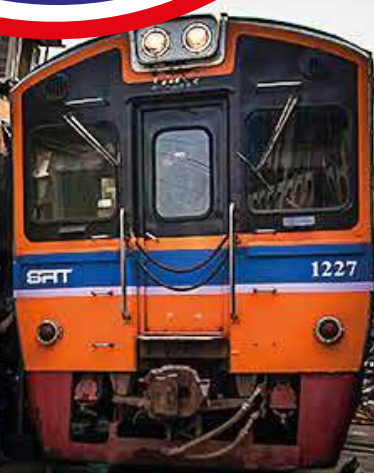
Maeklong Railway Market 铁路市场

行程次序，以当地旅社安排为准。 Sequences of Itinerary are subject to local arrangement.