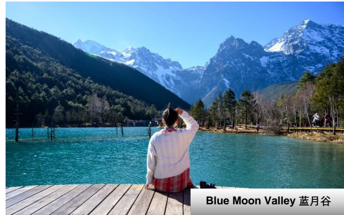
Blue Moon Valley 蓝月谷