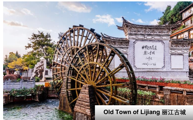
Old Town of Lijiang 丽江古城

*Sequence of itinerary subject to arrangement*