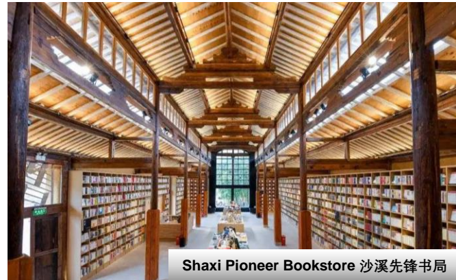
Shaxi Pioneer Bookstore 沙溪先锋书局