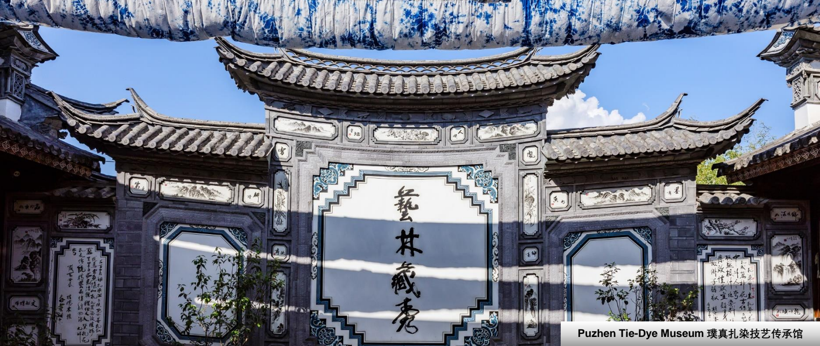
Puzhen Tie-Dye Museum 璞真扎染技艺传承馆