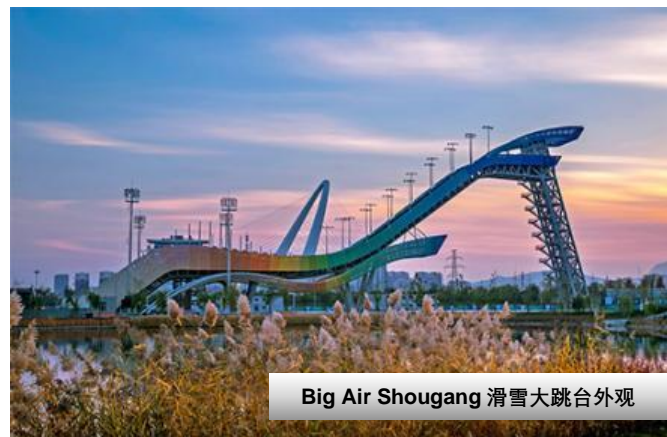
Big Air Shougang 滑雪大跳台外观