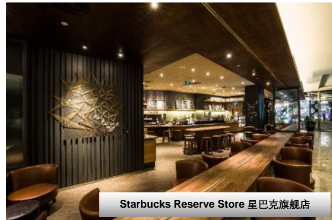
Starbucks Reserve Store 星巴克旗舰店