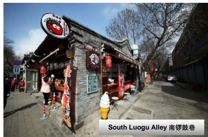
South Luogu Alley 南锣鼓巷