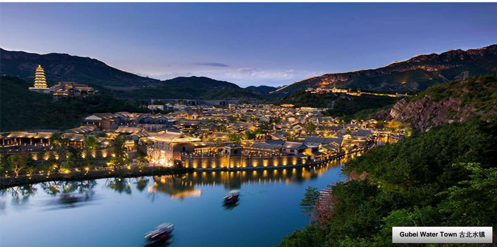
Gubei Water Town 古北水镇