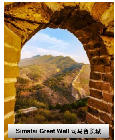
Simatai Great Wall 司马台长城

Taste of old Beijing, Beijing Roasted duck 老北京风味; 北京烤鸭