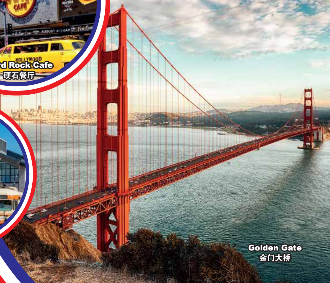
Golden Gate 金门大桥