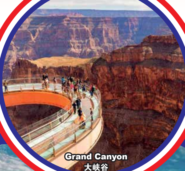
Grand Canyon 大峡谷