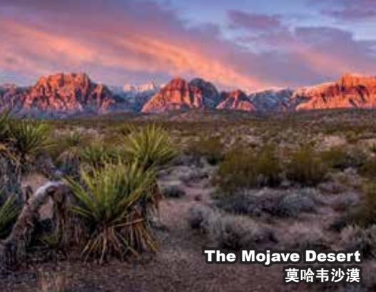
The Mojave Desert 莫哈韦沙漠