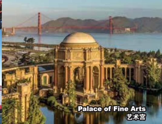
Palace of Fine Arts 艺术宫