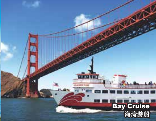
Bay Cruise 海湾游船