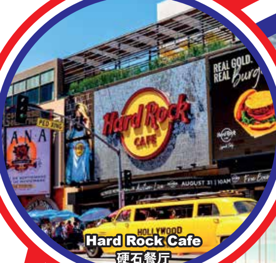
Hard Rock Cafe 硬石餐厅