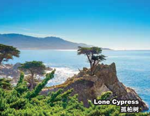
Lone Cypress 孤柏树