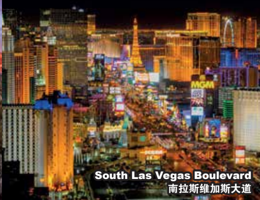
South Las Vegas Boulevard 南拉斯维加斯大道