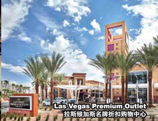
Las Vegas Premium Outlet 拉斯维加斯名牌折扣购物中心