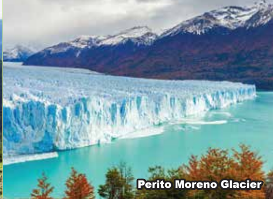
Perito Moreno Glacier