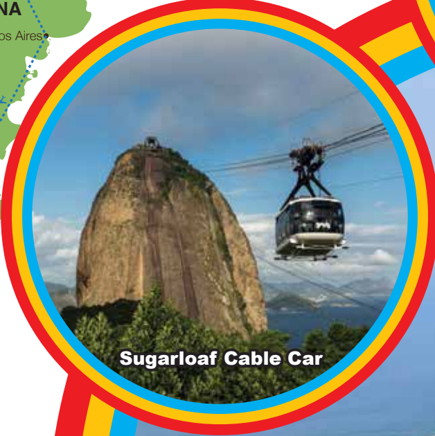
Sugarloaf Cable Car