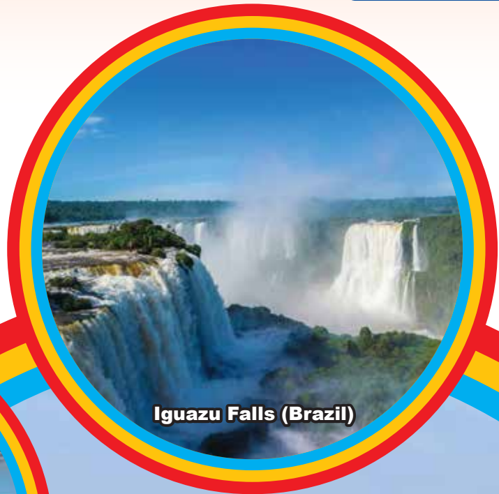
Iguazu Falls (Brazil)