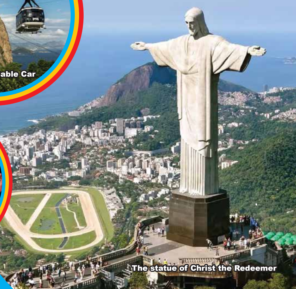
The statue of Christ the Redeemer