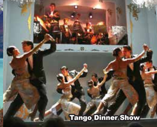
Tango Dinner Show