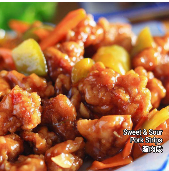
Sweet & Sour Pork Strips 溜肉段