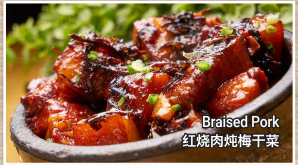
Braised Pork 红烧肉炖梅干菜