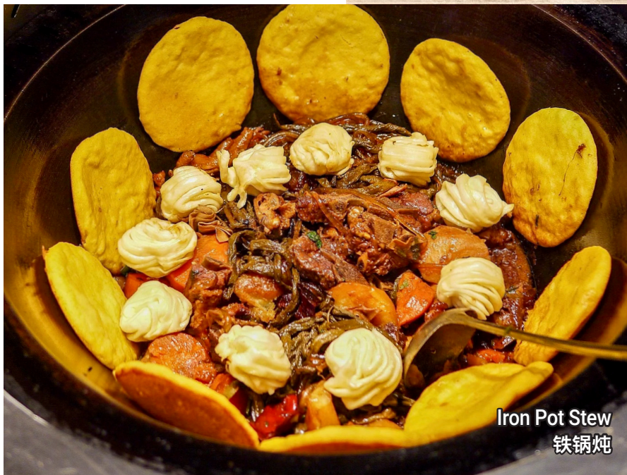
Iron Pot Stew 铁锅炖