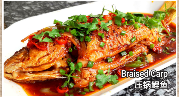
Braised Carp 压锅鲤鱼