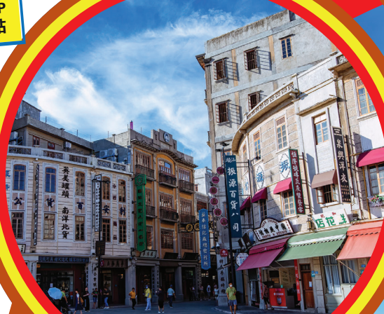
Old Town Arcade Buildings 老城骑楼建筑群