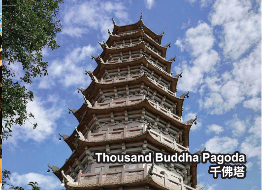
Thousand Buddha Pagoda 千佛塔