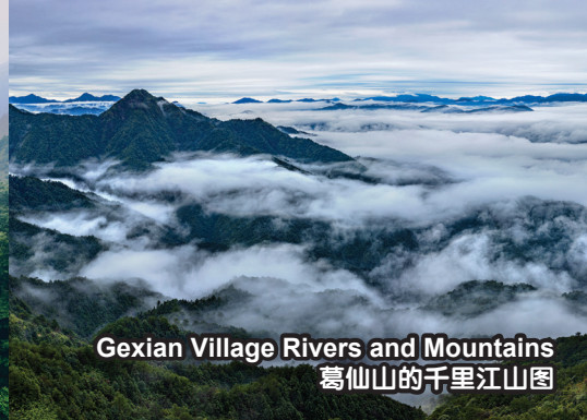
Gexian Village Rivers and Mountains 葛仙山的千里江山图