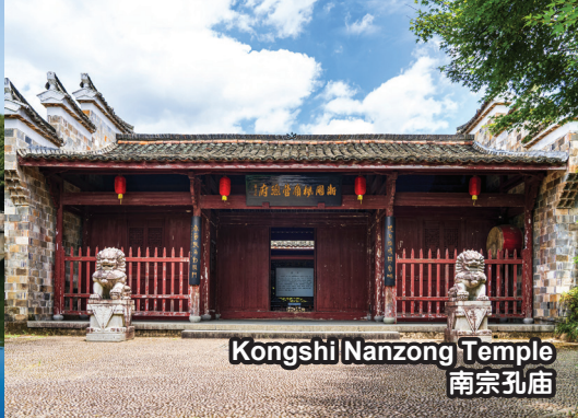
Kongshi Nanzong Temple 南宗孔庙