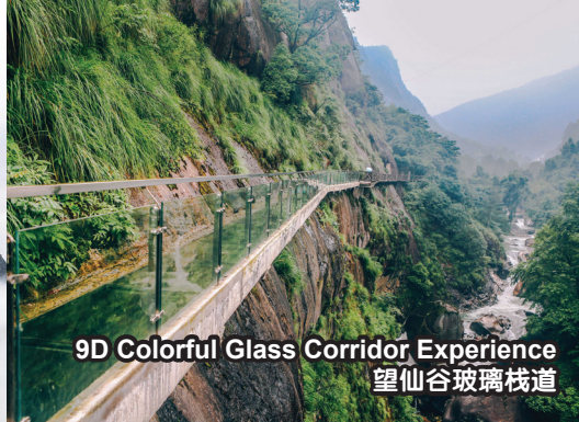
9D Colorful Glass Corridor Experience 望仙谷玻璃栈道