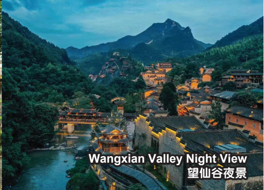
Wangxian Valley Night View 望仙谷夜景