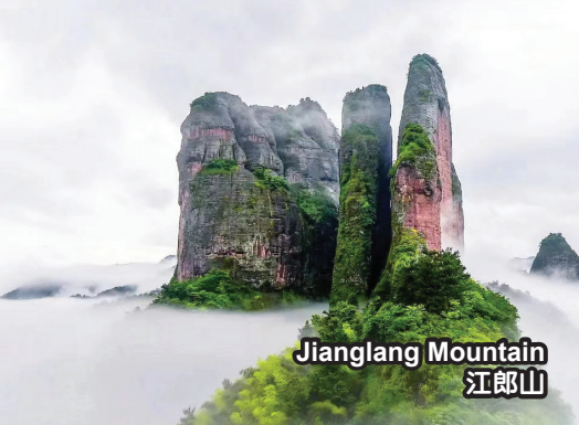
Jianglang Mountain 江郎山