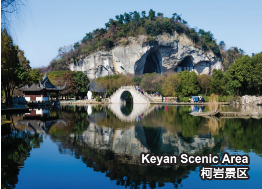
Keyan Scenic Area 柯岩景区