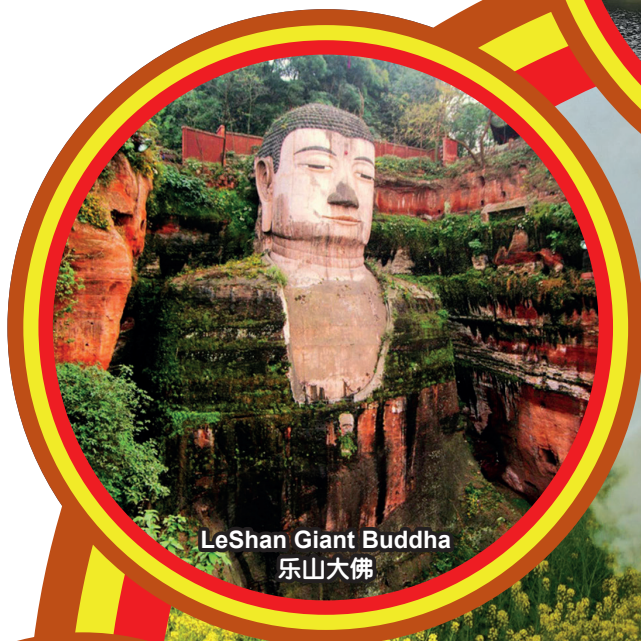
LeShan Giant Buddha 乐山大佛