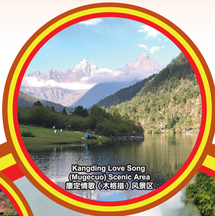
Kangding Love Song (Mugecuo) Scenic Area 康定情歌(木格措)风景区