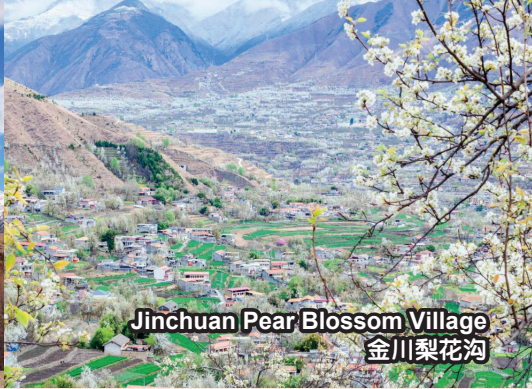
Jinchuan Pear Blossom Village 金川梨花沟