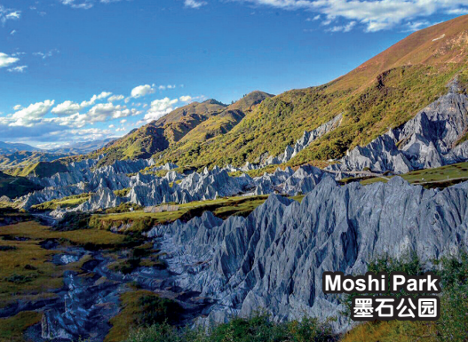
Moshi Park 墨石公园