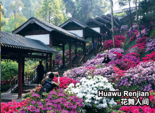
Huawu Renjian 花舞人间