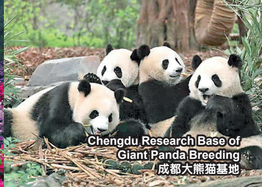
Chengdu Research Base of Giant Panda Breeding 成都大熊猫基地