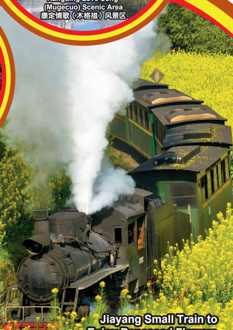
Jiayang Small Train to Enjoy Rapeseed Flowers 嘉阳小火车赏油菜花

行程次序，以当地旅社安排为准。 Sequences of Itinerary are subject to local arrangement.