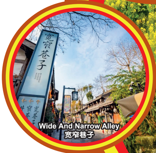
Wide And Narrow Alley 宽窄巷子

行程次序，以当地旅社安排为准。 Sequences of Itinerary are subject to local arrangement.