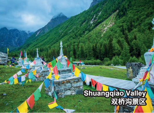
Shuangqiao Valley 双桥沟景区