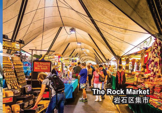
The Rock Market 岩石区集市