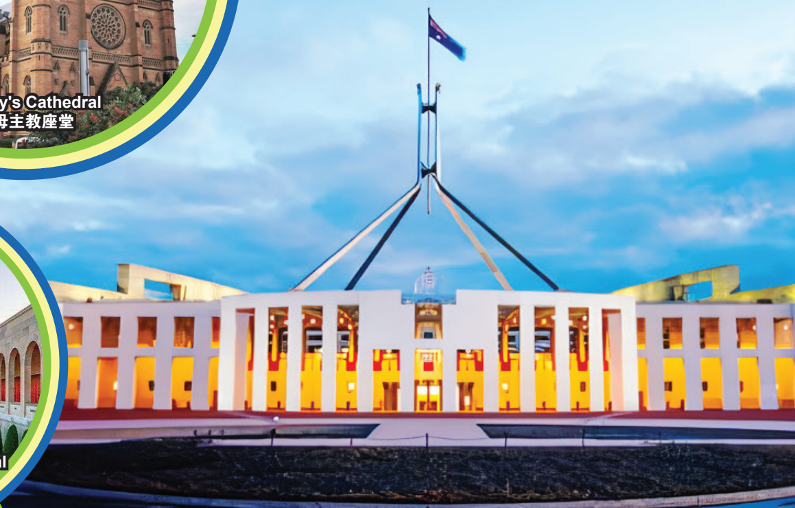
Best of Australia Parliament House Tour 堪培拉国会大厦

行程次序，以当地旅社安排为准。 Sequences of Itinerary are subject to local arrangement.