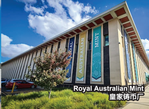
Royal Australian Mint 皇家铸币厂