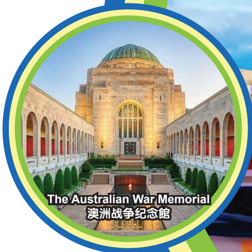
The Australian War Memorial 澳洲战争纪念馆