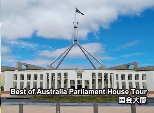
Best of Australia Parliament House Tour 国会大厦