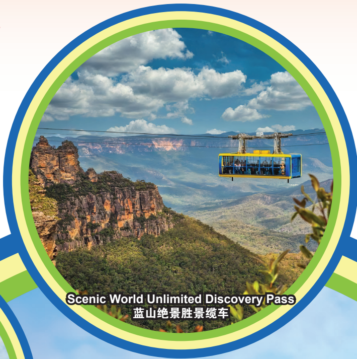
Scenic World Unlimited Discovery Pass 蓝山绝景胜景缆车