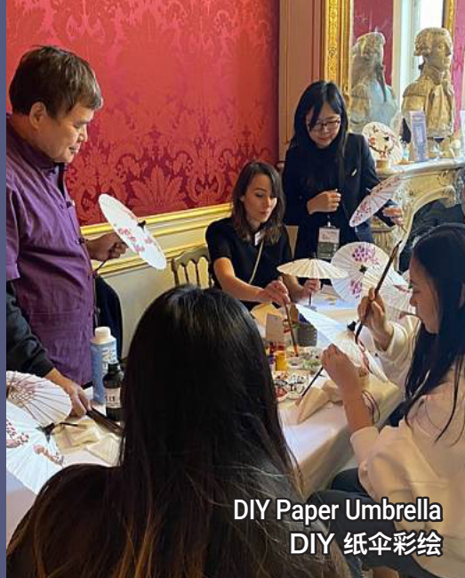
DIY Paper Umbrella DIY 纸伞彩绘