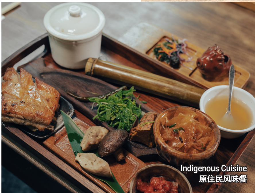
Indigenous Cuisine 原住民风味餐