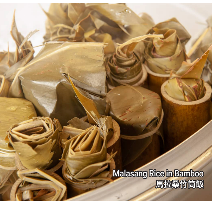
Malasang Rice in Bamboo 馬拉桑竹筒飯