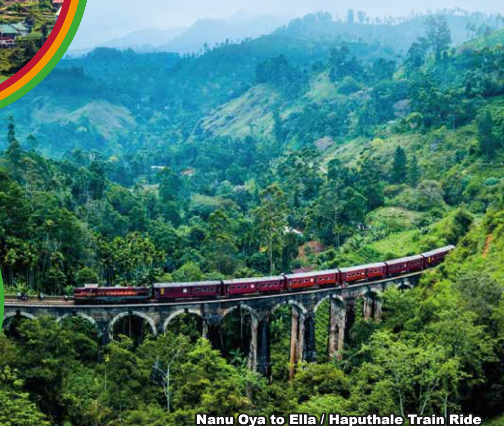
Nanu Oya to Ella / Haputhale Train Ride