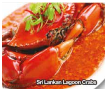
Sri Lankan Lagoon Crabs

Disclaimer: Due to Covid-19 travel restrictions, local / religious festivals, public holidays, weather condition, transport technical issue, acts of nature, Golden Destinations reserved the right to alter the sequence or change, amend or alter the itinerary if necessary, with or without prior notice.