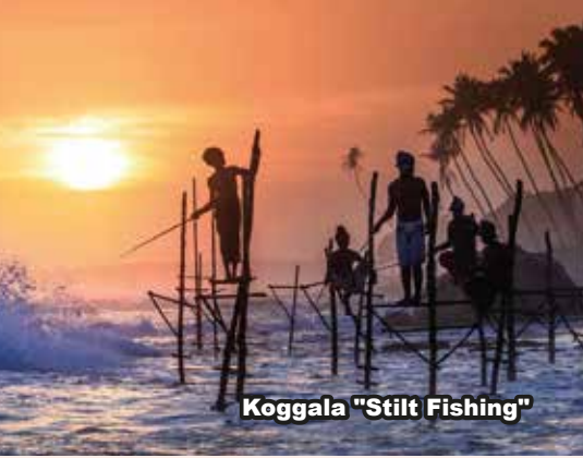
Koggala "Stilt Fishing"