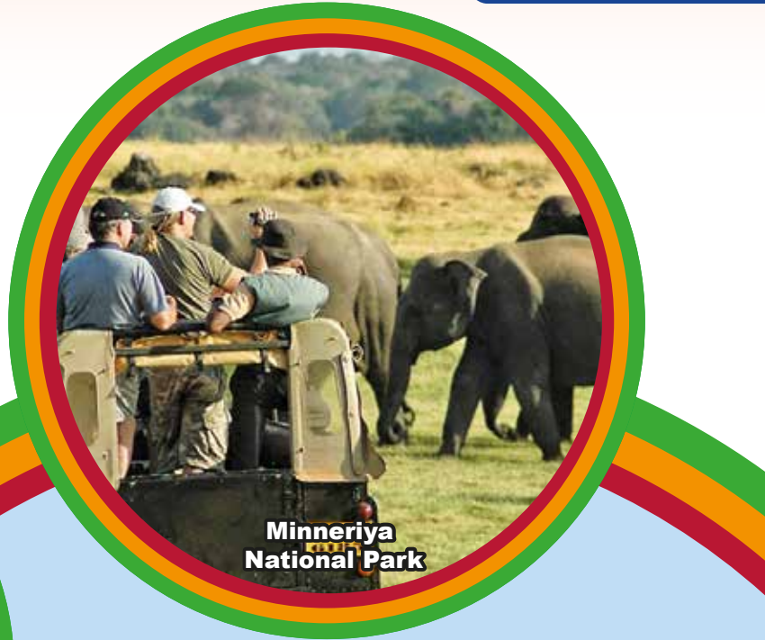
Minneriya National Park