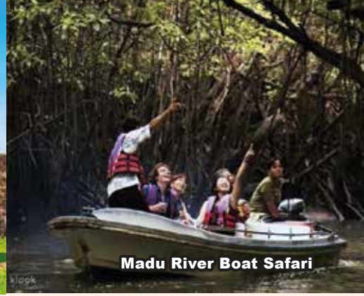
Madu River Boat Safari