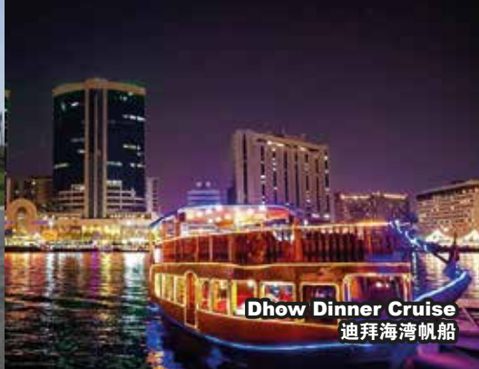
Dhow Dinner Cruise 迪拜海湾帆船