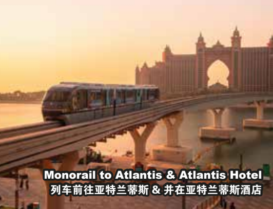
Monorail to Atlantis & Atlantis Hotel 列车前往亚特兰蒂斯 & 并在亚特兰蒂斯酒店