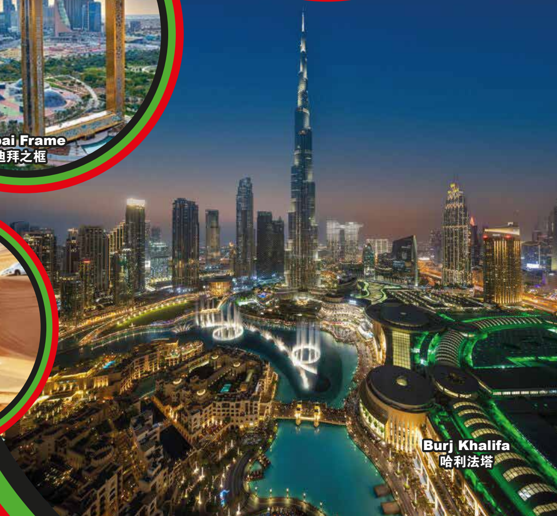
Burj Khalifa 哈利法塔