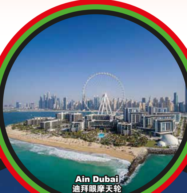
Ain Dubai 迪拜眼摩天轮