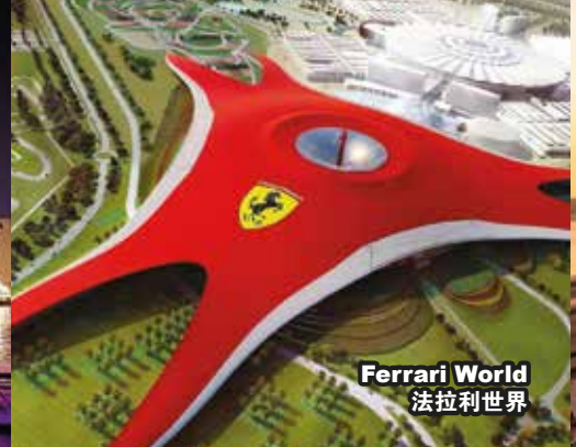
Ferrari World 法拉利世界