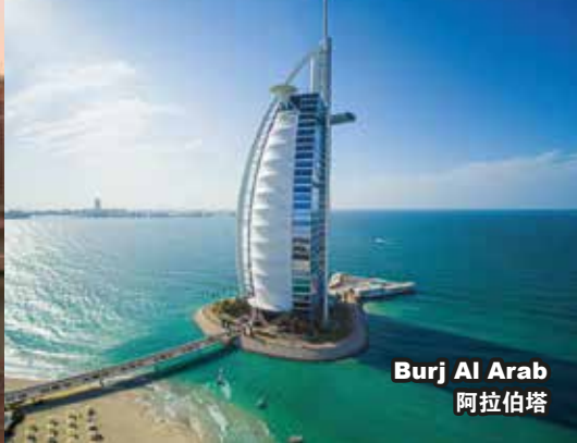
Burj Al Arab 阿拉伯塔