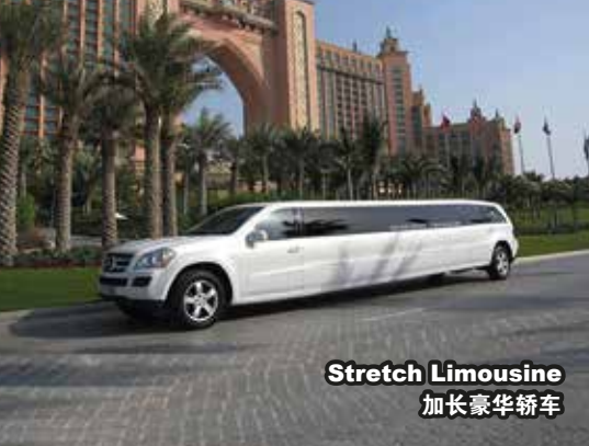
Stretch Limousine 加长豪华轿车