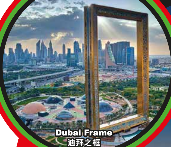
Dubai Frame 迪拜之框