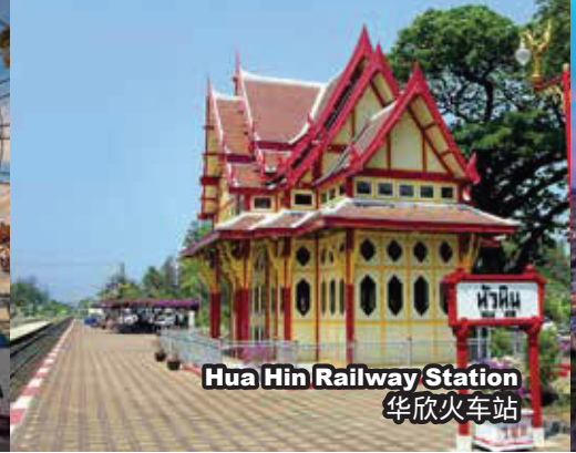
Hua Hin Railway Station 华欣火车站