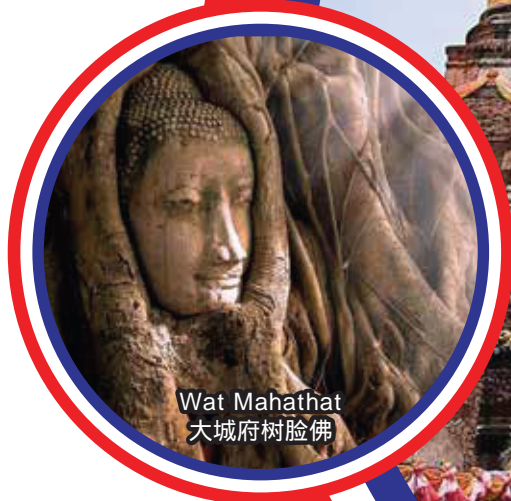
Wat Mahathat 大城府树脸佛