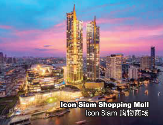
Icon Siam Shopping Mall Icon Siam 购物商场