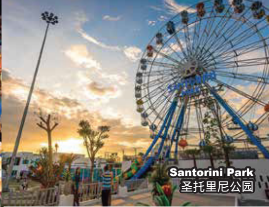
Santorini Park 圣托里尼公园