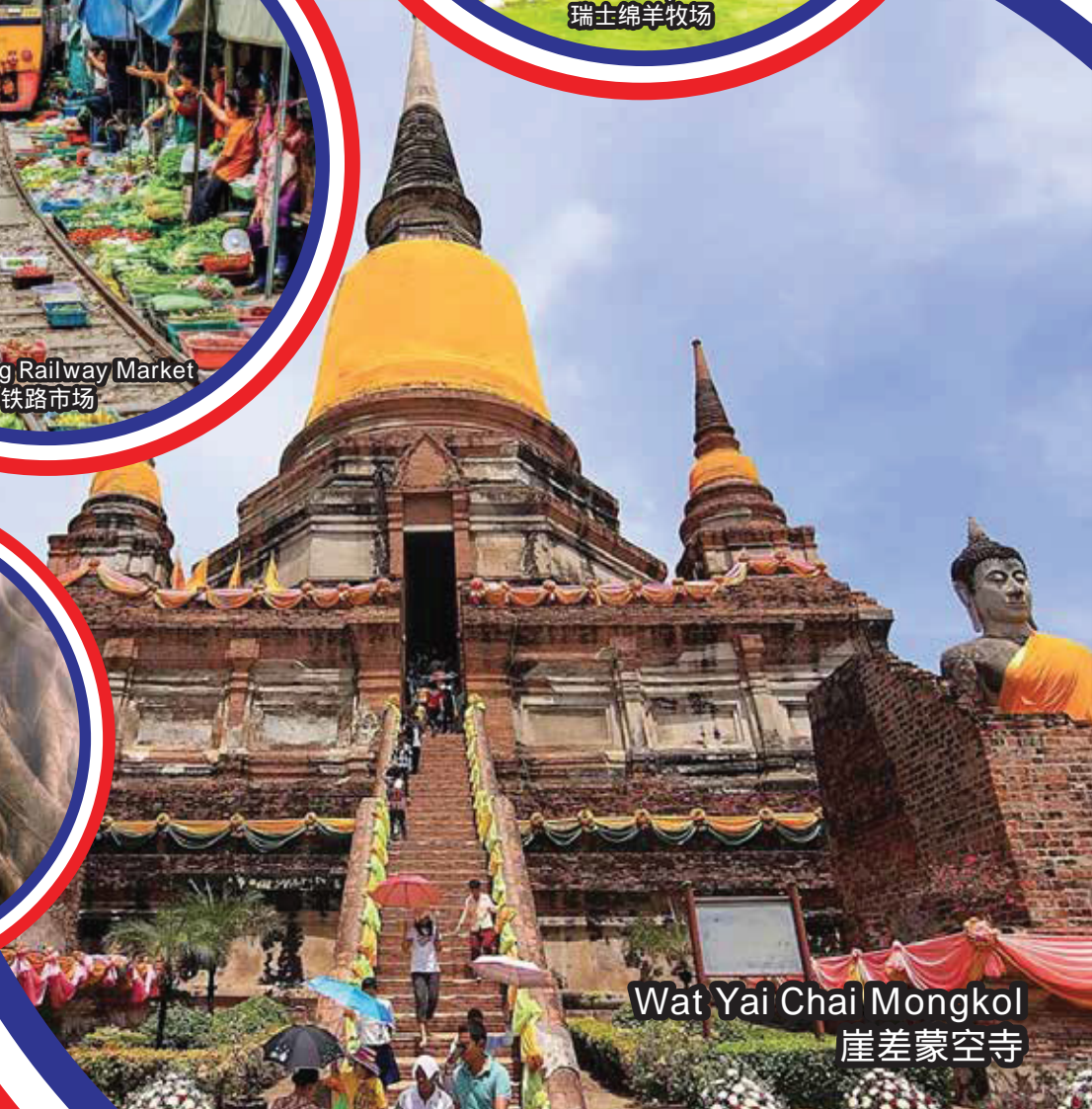
Wat Yai Chai Mongkol 崖差蒙空寺