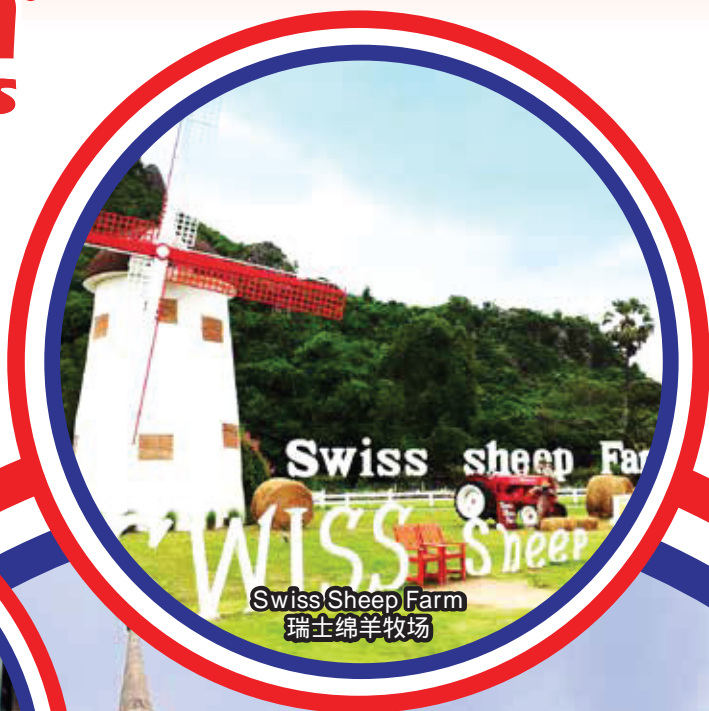
Swiss Sheep Farm 瑞士绵羊牧场