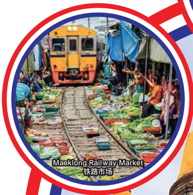
Maeklong Railway Market 铁路市场