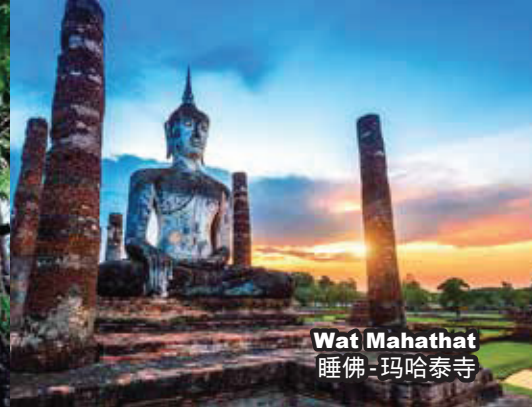
Wat Mahathat 睡佛 - 玛哈泰寺