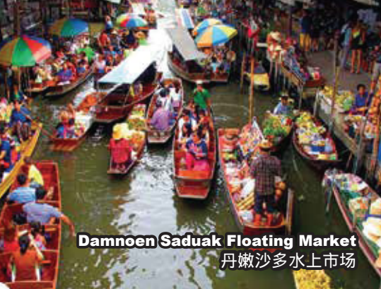
Damnoen Saduak Floating Market 丹嫩沙多水上市场