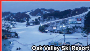
Oak Valley Ski Resort

Sequences of Itinerary are subject to local arrangement.